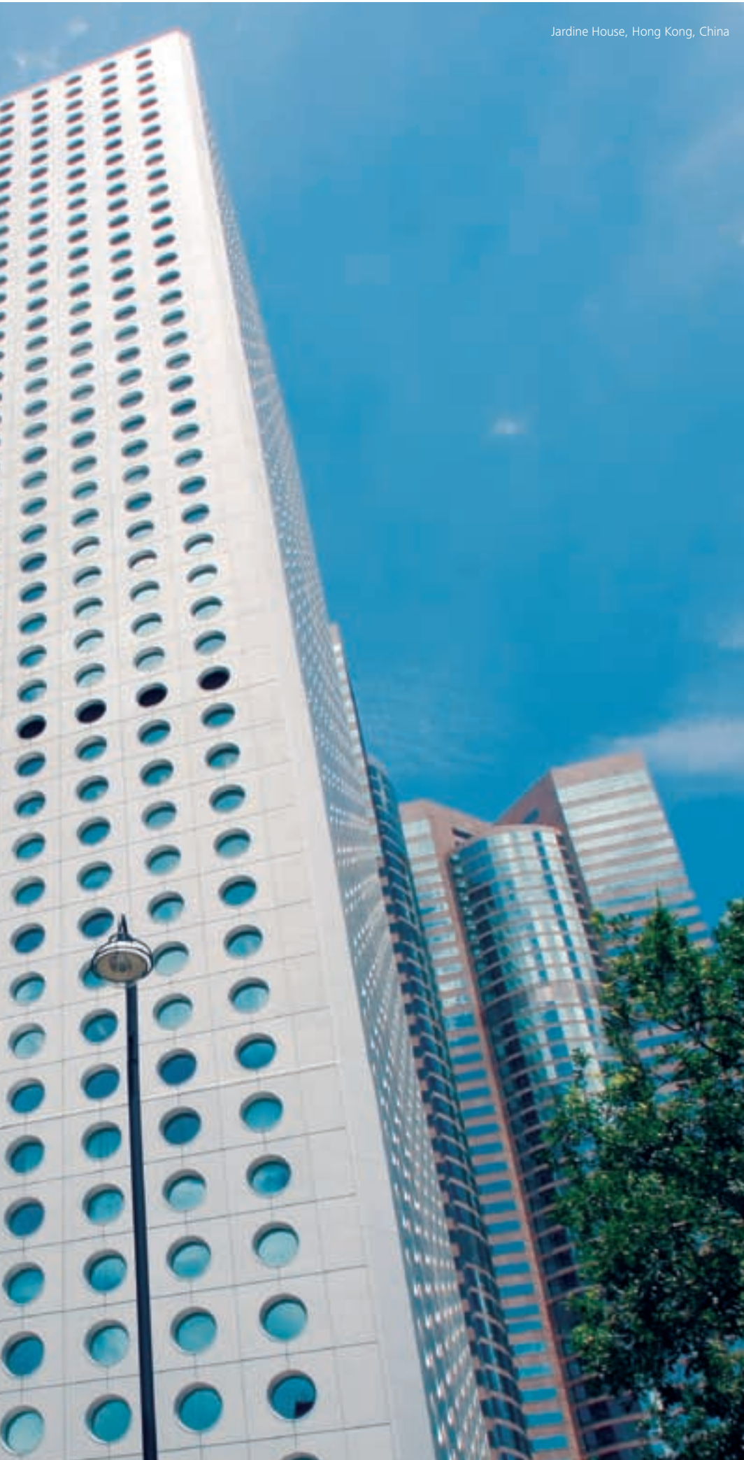
Jardine House, Hong Kong, China