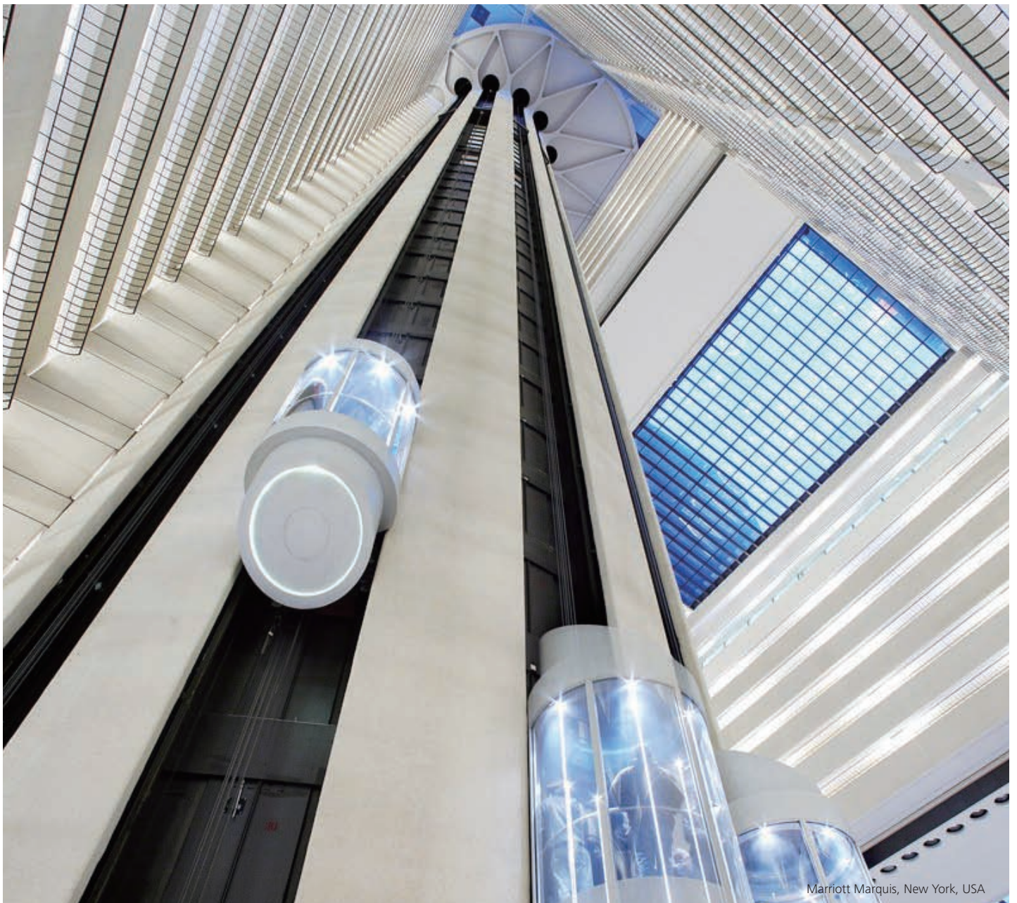
Marriott Marquis, New York, USA